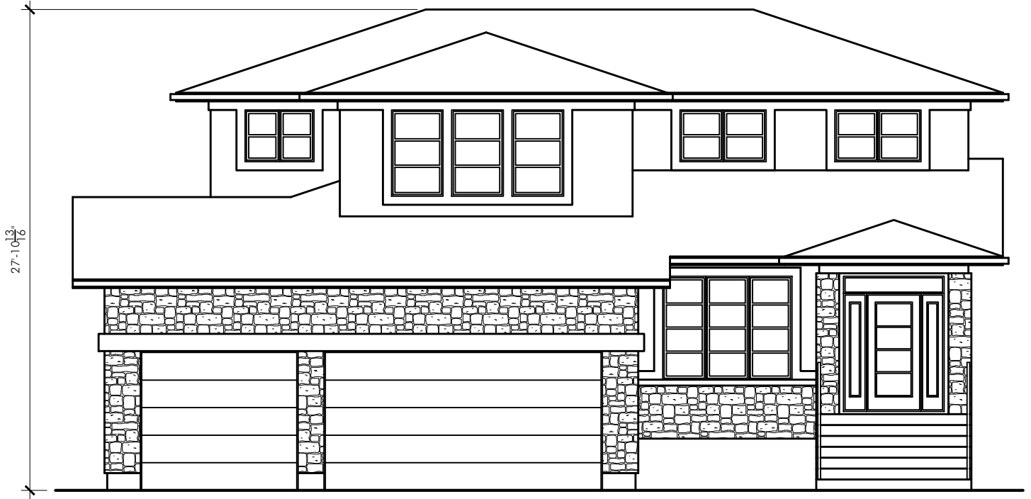
FRONT ELEVATION SANDFORD-2463