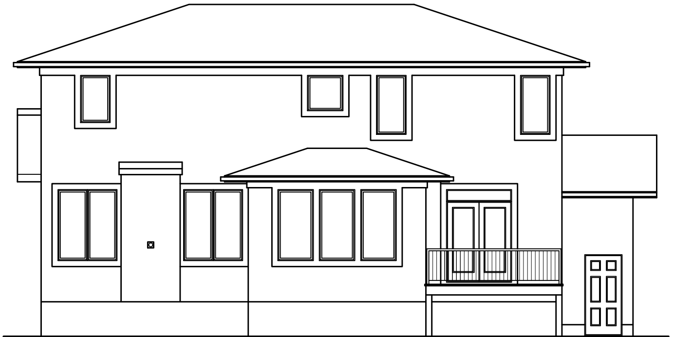
REAR ELEVATION SANDFORD-2463