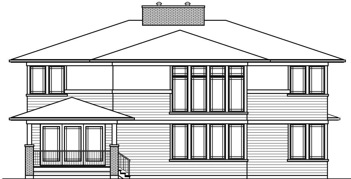
REAR ELEVATION WRIGHT-3996