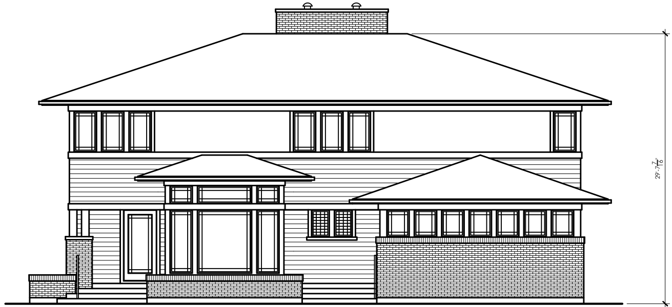
FRONT ELEVATION WRIGHT-3996