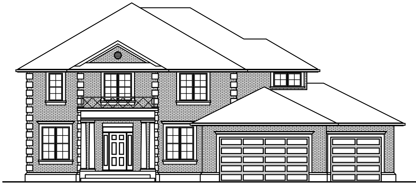
FRONT ELEVATION BRIGHTON-3431