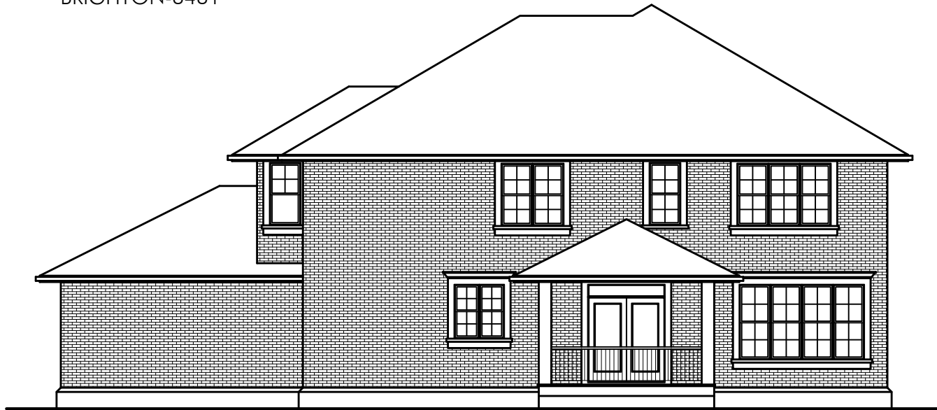
REAR ELEVATION BRIGHTON-3431