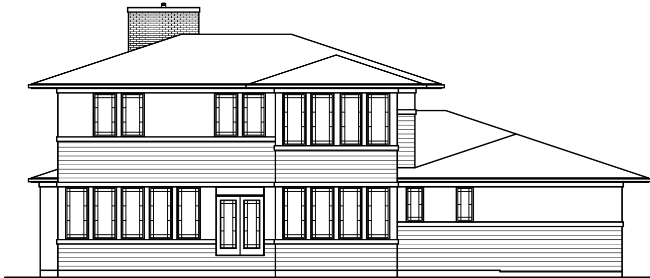
REAR ELEVATION LOWRY-3512