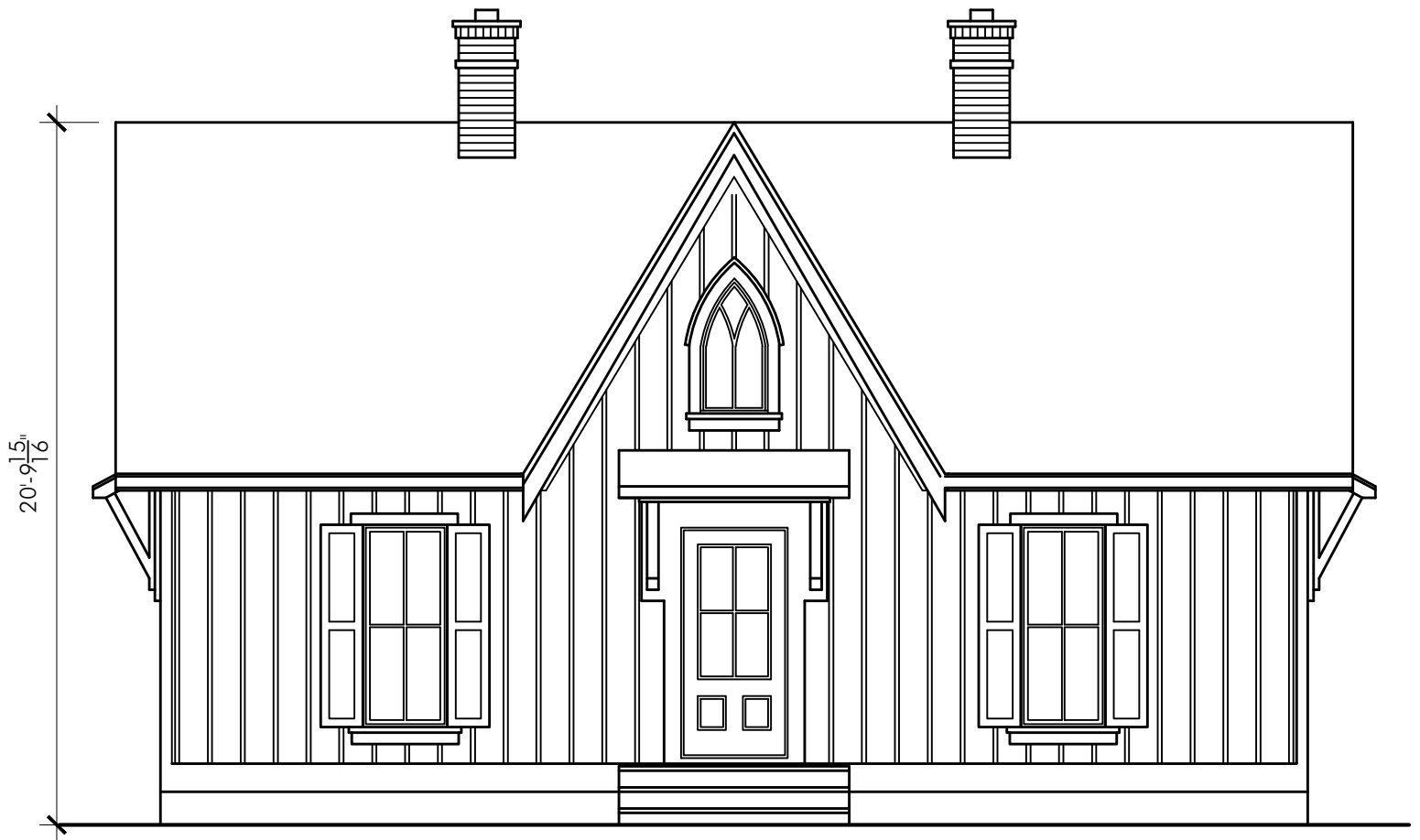
FRONT ELEVATION ONTARIO-476