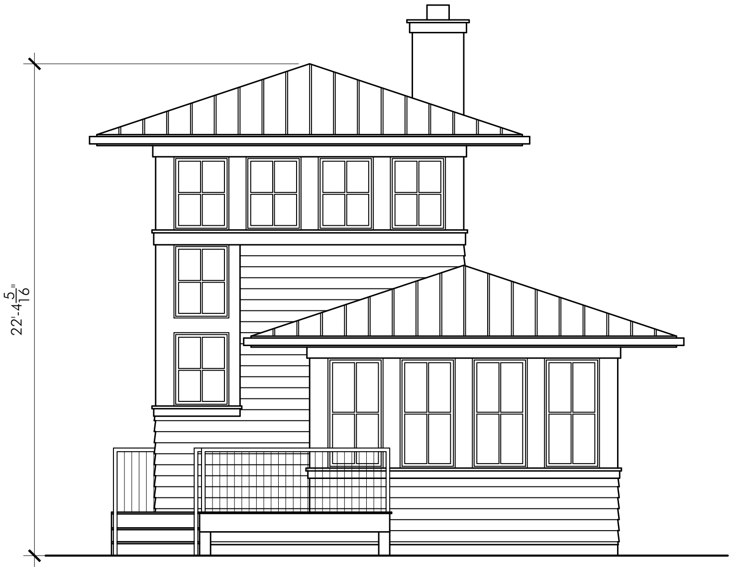
FRONT ELEVATION NORTHWEST TERRITORIES-521