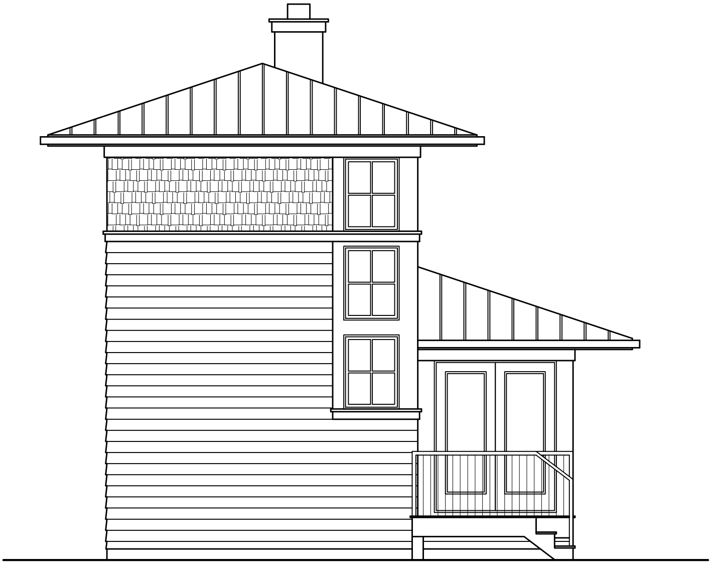
SIDE ELEVATION NORTHWEST TERRITORIES-521